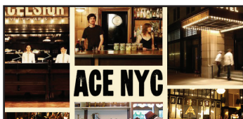
The Ace Hotel: 20 W 29th St